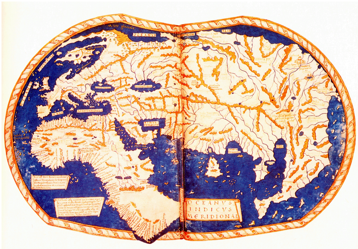
Waldseemuller World Map – 1507